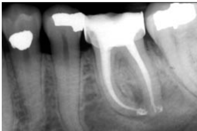
Fig. 25.1. Mandibular molar with severe multi-planar curvatures in the mesial canals as well as an abrupt apical curvature in the distal canal. When this case was done in 1979 there was only one technique that could have successfully shaped these root canals without ledging, ripping, or transportation—the Serial Step-Back Schilder Technique.

During the 1980's, the Vertical Condensation Technique 4 (Fig. 25.1) was significantly improved through the introduction of two electronic devices: the Touch-and-Heat electric heat carrier by Analytic Technology and the Obtura gutta-percha gun by Obtura Corp. These devices helped to make 3D warm gutta-percha obturation more accessible to clinicians at all skill and experience levels.