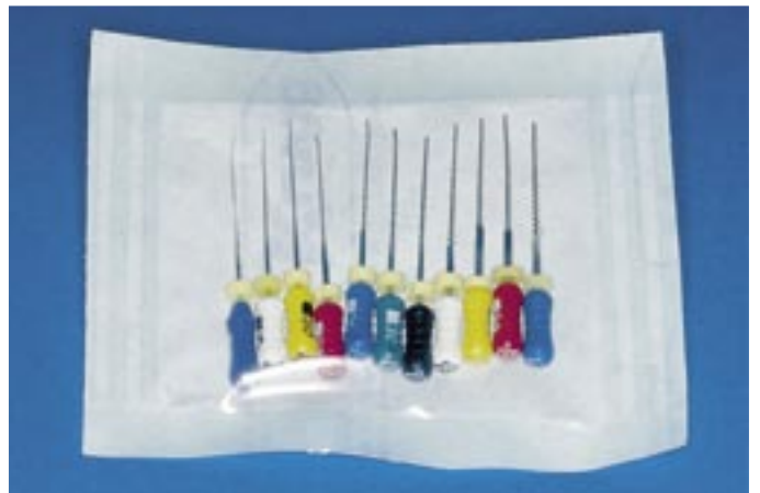
Fig. 15.1. A. The series of instruments are placed in a sterilizer bag and sterilized (continued).

Furthermore, they must be precurved and equipped with rubber stops.